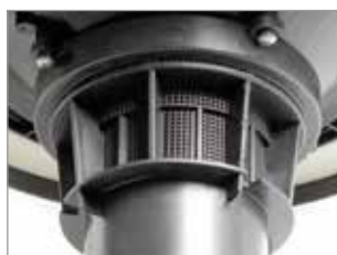
INTEGRATED ANTI-FOAM SYSTEM