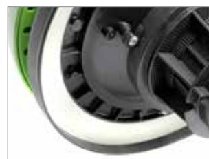
INNOVATIVE HEAD GASKET