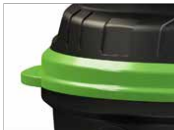
SIDE PROTECTIONS AGAINST DOORS AND WALLS: bumpers protect the machine from damages and surrounding obstacles