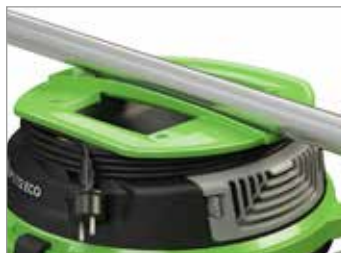
HANDLE WITH INTEGRATED CABLE WRAP. TUBE CAN BE ALSO GRABBED WITH HANDLE