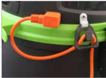
DETACHABLE CABLE AVOIDS DISASSEMBLY OF THE MACHINE IN CASE OF FAULTY