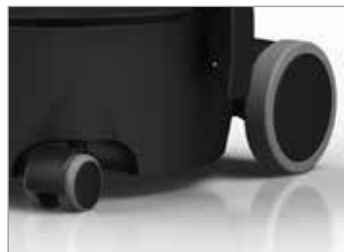
NON-MARKING RUBBER WHEELS: the rubber cover avoids any noise effects on tilted floors and unlevelled surfaces