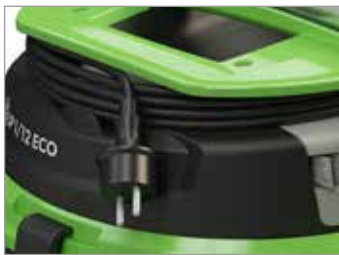
CONVENIENT HANDLE WITH INTEGRATED CABLE WRAP