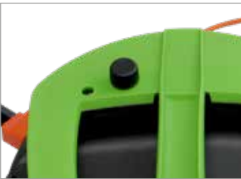
SPEED REGULATOR ALLOWS NOISE ADJUSTMENT WHEN REQUIRED