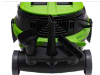
TOOLS HOLDER OPTIONAL KIT