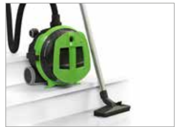
STEP POSITION: simple to use even in very small spaces and on stairs