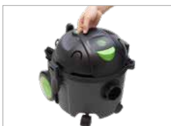
LIGHTWEIGHT DESIGN (ONLY 3,7 KG)