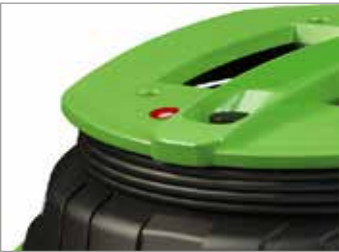
FULL BAG INDICATOR: warning light "on" when bag is full