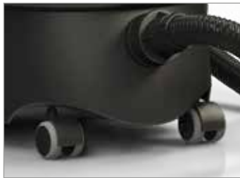
NON-MARKING RUBBER WHEELS: the rubber cover avoids any noise effects on tilted floors and unlevelled surfaces