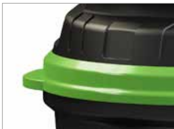
SIDE PROTECTIONS AGAINST DOORS AND WALLS: bumpers protect the machine from damages and surrounding obstacles