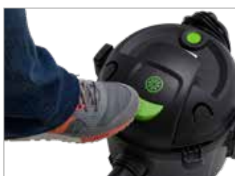
FOOT-ACTIVATED ON/OFF SWITCH