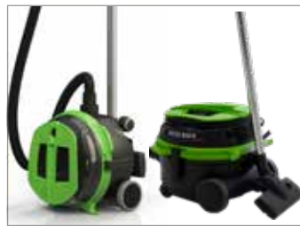
DOUBLE PARKING POSITION