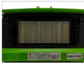
HEPA / POLY CARTRIDGE DOWNSTREAM