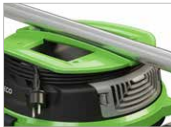
TUBE CAN BE ALSO GRABBED WITH HANDLE