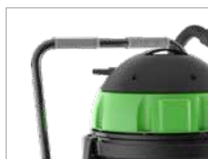
TROLLEY WITH HANDLE